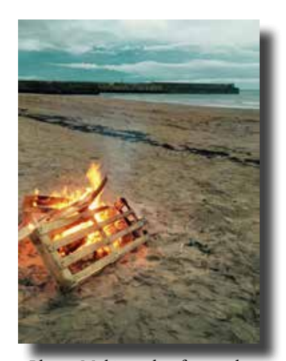
Photo: Making a bonfire on the beach while doing experiential research.

Of course, there is a close relationship between dance and music. Rhythm of movement may be transposed into the rhythm of music. To capture the burning bush of Exodus 3, the composer gave the organ a recurring, steady rhythm to suggest the constant movement of flames; theologically, this also suggests the consistency of God's character. A sense of the flames 'rising' and 'falling' comes from the organ rising and falling in pitch and volume. This ensures that the music portrays a burning bush which is not static or inanimate, but reflects the living God who speaks 'out of the fire' (Deut. 4:12).