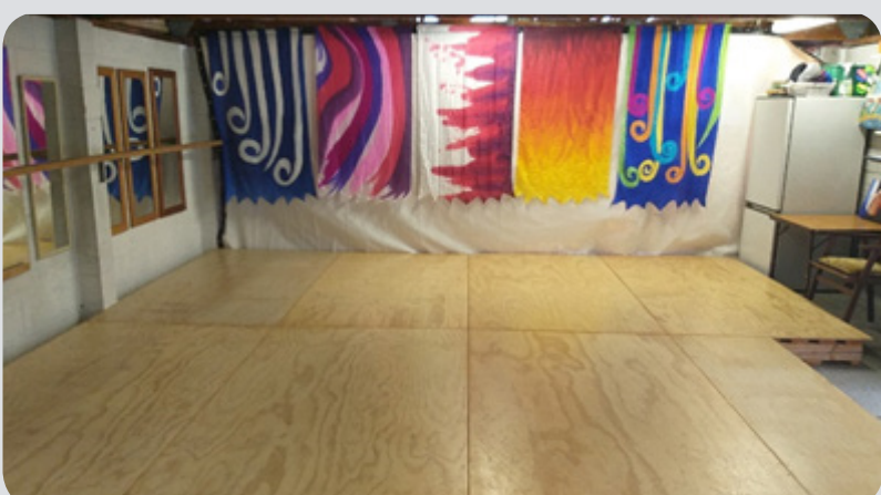
Lockdown private home studio with worship flags & fridge!