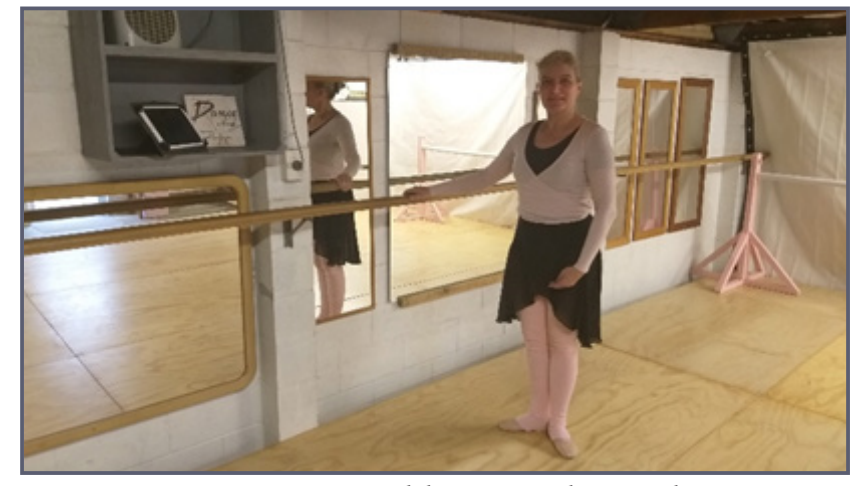
Lockdown private home studio in our garage

in April/July/October. As a dance school we timetable a mini mid-year concert in June and an end of year Recital (full dance school production in costume) in December. We timetable our dance exams for the end of Term 3 in September. We use LDI (www. livingdanceinternational.com) Christian Ballet and Jazz & Contemporary curriculums and GE (www.generationedinburgh.co.uk) Christian Tap and Jazz curriculums for our dance classes. Upon lockdown we lost two weeks of Term 1 and four weeks of Term 2.