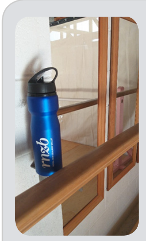
Royal NZ Ballet drink bottle

National Co-Ordinator, ICDF Aotearoa New Zealand