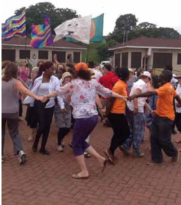
Photo taken during the Flashmob at the Ghana Conference

For more testimonies go to ... http://conference.icdf.com/testimonies