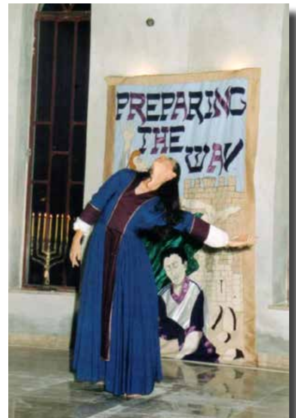
Photo: Taken at the first ICDF conference in Jerusalem, 1991