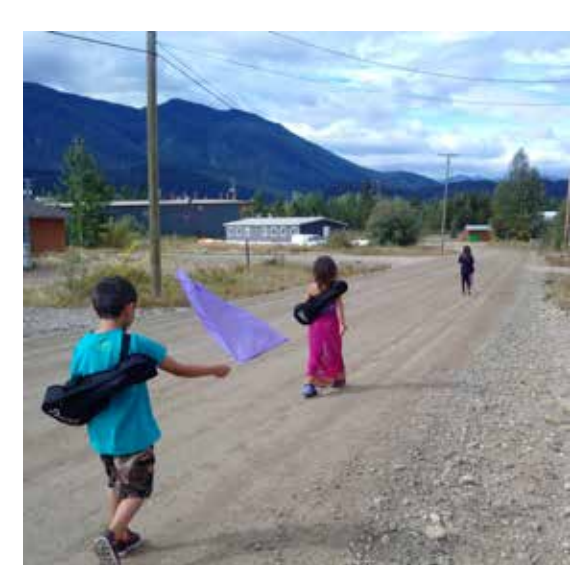
Children on the last day walking home with the ukuleles on their back carrying their flags

When the government became aware of the people living here, they started sending in planes to round up the children and take them to Residential School. Every Christmas they would return the children and leave them by the river. So one man built a cabin along the river so he could be there when his children came home. The rest of the families began to build in the same area so they became loosely connected just based on the fact they were all waiting for their children to come home. Sad thing is not all these children ever made it home. The children that did make it back are now all the elders and descendants. Even from the air one could see the depression and poverty that had gripped this village. Every house had 2 or more windows smashed in which is the result of people drinking and then throwing their bottles through the windows.