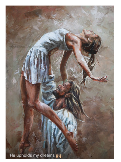
Artist: House of Maria

Although they left the studio, when I next saw them they were friendly and chatted away as though nothing had ever been said. While I wouldn't always advocate ignoring messages, this one was too toxic to respond to and was the correct thing to do: 'in the Spirit, in the opposite spirit!'