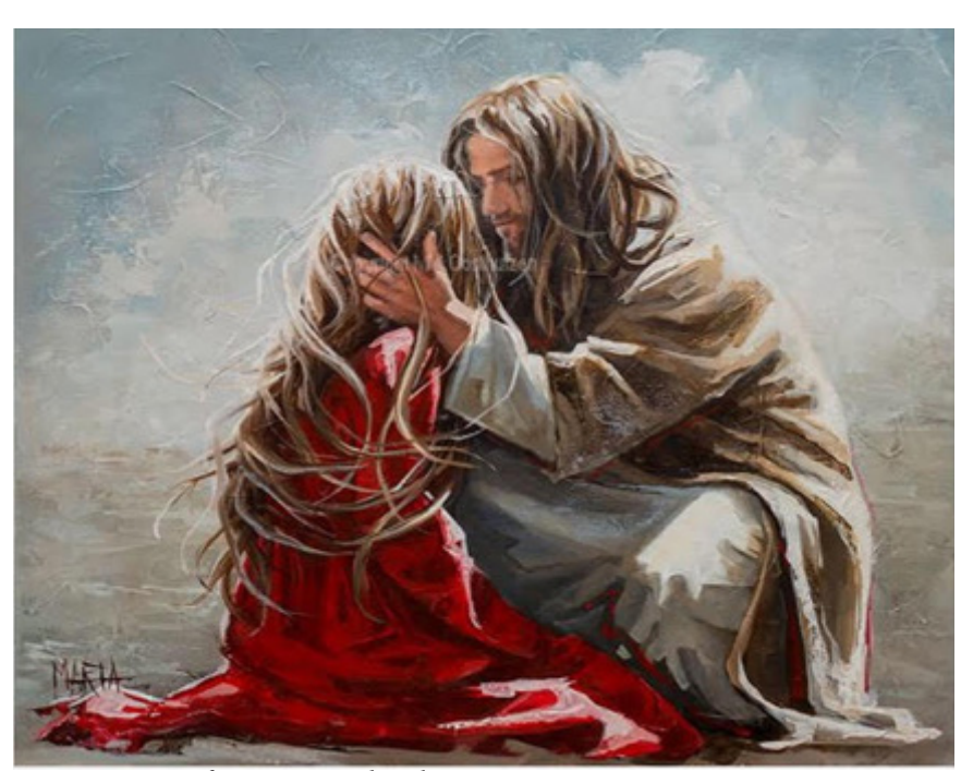
Artist: House of Maria - used with permission

"In step?" she asked, " In step." He firmly replied. " but, how?" " just keep your eyes firmly on me and I will lead The Way."