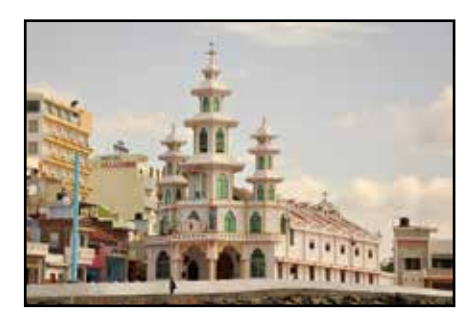
A church situated on the harbour